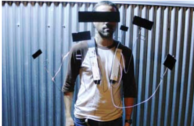
Dynamic Reality Censor System. A Creative Process assignment in Foundation.

Full Article | February 16, 2007 01:10 AM